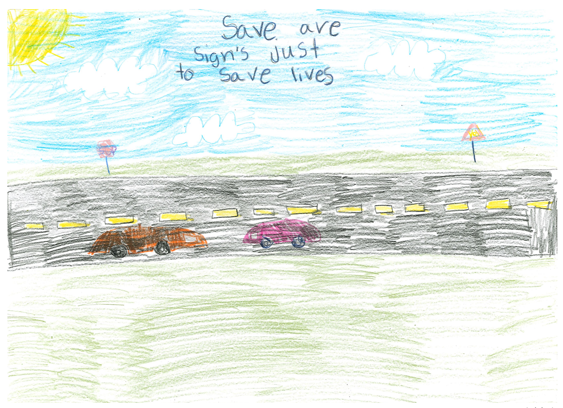
Leigha L. Park River Elementary