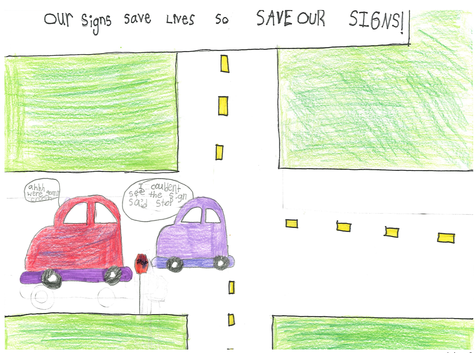
Aubrey S. Cavalier Elementary