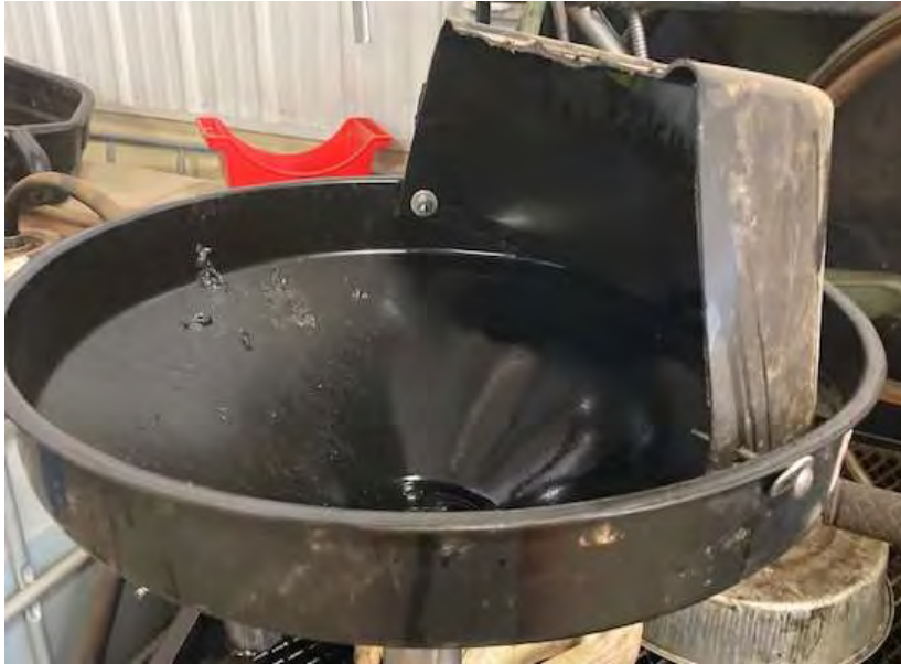
Funnel with retrofitted splash guard