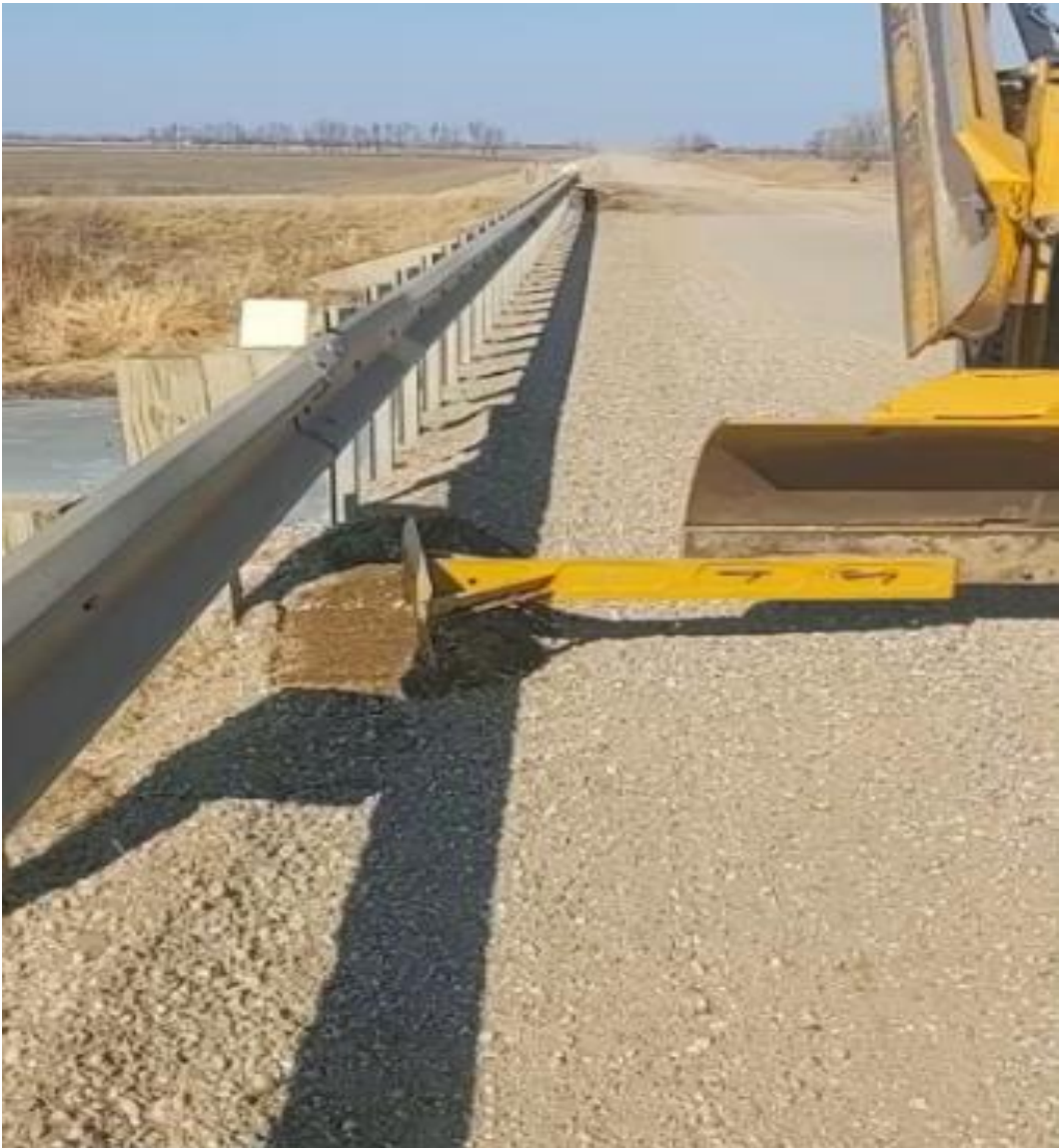
Pulling debris, gravel, vegetation that has accumulated between posts