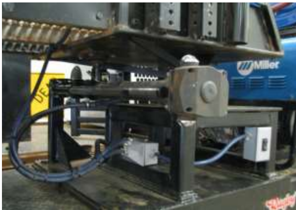
Camper Jack and Pivot Hub

The redesigned sign truck changes the signing operation from a two person to a one person operation. The changes to the catwalk and holders for the air hammer and auger; and redesigning the ladder reduces the exposure to injuries to employees. All the changes increase the efficiency of the signing operation and the reduction to possible bodily injury is a great benefit to employees and saves the county money in possible workers compensation costs.