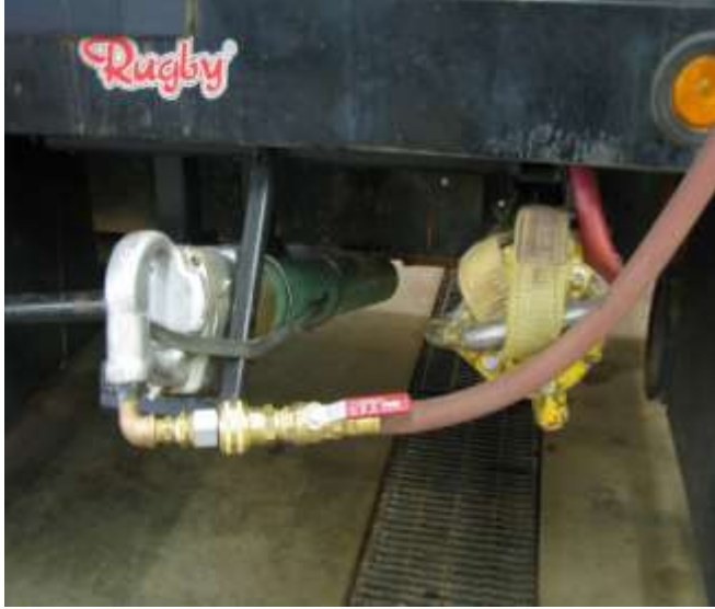
HOLDERS FOR AIR HAMMER AND AUGER