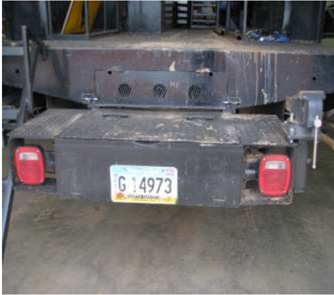
Work Bench with Vise