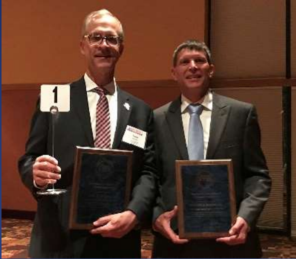
Urban & Rural County Engineers of the Year