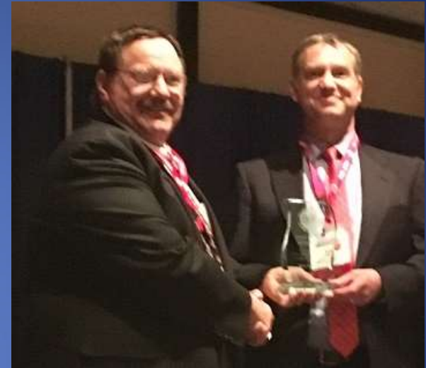
David P. Brand Safety Award