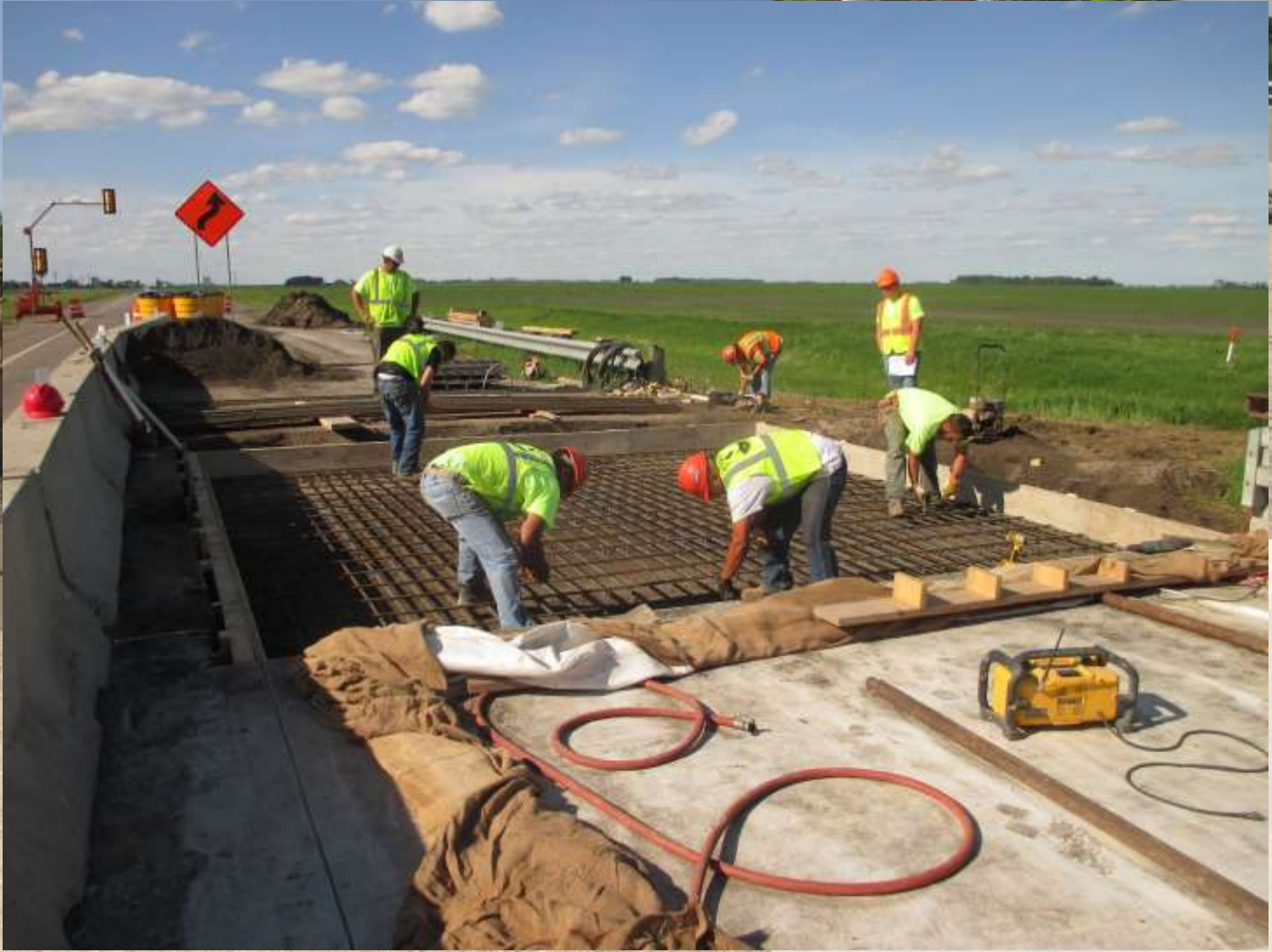
2019 North Central Local Roads Conference